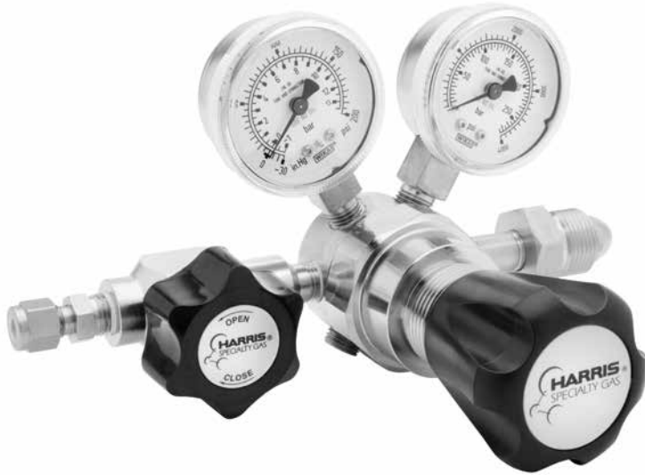
Model HP 721C-125-580-BE-1 shown

Model HP 721 is a single stage cylinder regulator available in brass (HP 721) or chrome plated brass (HP 721C) barstock for pressure control of non corrosive gases when pressure rise is not critical. The HP 721 is suitable for: